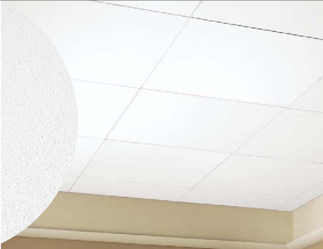
Optima Vector with Prelude® 15/16" suspension system (Pg. 259)

Items with Breakthrough Plant-based Binder have a PB Suffix