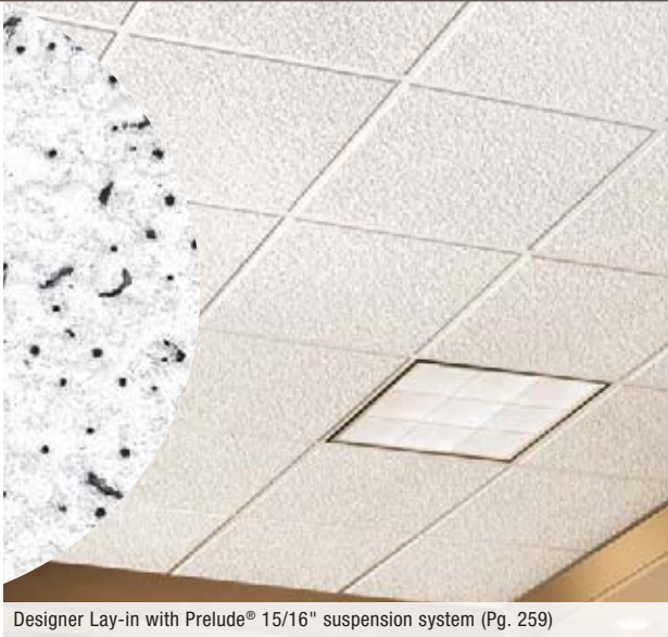
Designer Lay-in with Prelude® 15/16" suspension system (Pg. 259)

Calculate LEED contribution at armstrong.com/greengenie *LOCATION DEPENDENT