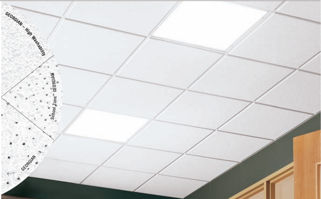
Georgian Beveled Tegular with Prelude® 15/16" suspension system (Pg. 259)